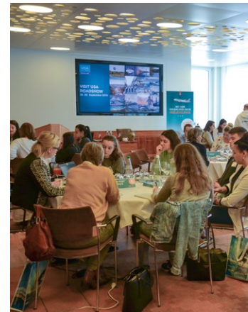
*subject to change